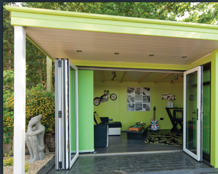
Green Arcadia shown with non standard bi-fold door option – POA