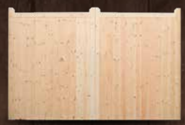
Square Top Gate

Square Top +£0.00 Omega Top +£75.00 Bow Top +£60.00 Pressure Treated Finish +£75.00