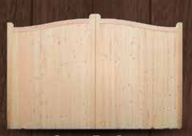
Omega Top Gate