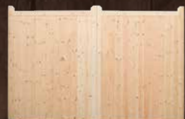
Square Top Gate

Square Top + £0.00 Omega Top + £75.00 Bow Top + £60.00 Pressure Treated Finish + £75.00