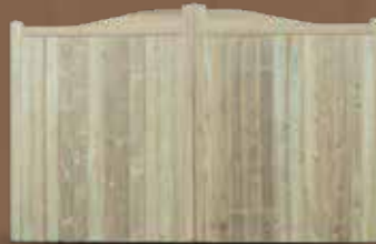
Omega Top Gate