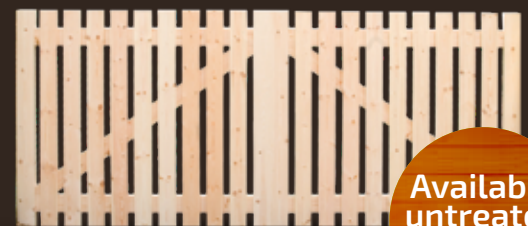
Square Top Gate

All of our driveway gates are manufactured to your exact requirements. Take your required height and overall width for the pair of gates, and calculate your price using the grid below. For intermediate sizes, please price using the next size up eg for 2.9m, use 3.0m price.