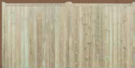
Square Top Gate