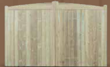
Bow Top Gate