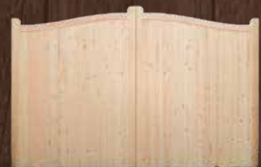
Omega Top Gate