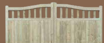
Regency Top Gate