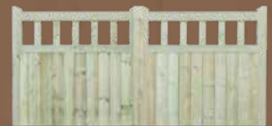
Midgley Top Gate