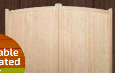
Bow Top Gate